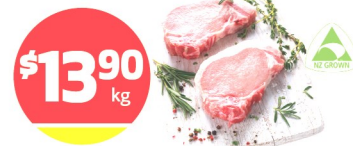
Fresh NZ Pork Loin Chops (Excludes Free Range)