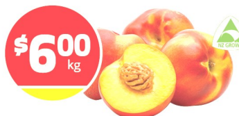
Loose Yellow Flesh Nectarines

Prices valid 24th-30th January 2022, or whilst stocks last.