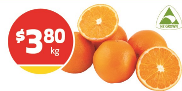
Loose New Season Navel Oranges