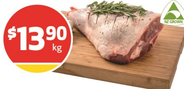
Fresh NZ Lamb Leg Roast

Prices apply until 5th July 2020. While stocks last at SuperValue Milton only.