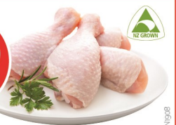
Fresh NZ Chicken Drumsticks