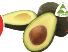
Loose Hass Avocados