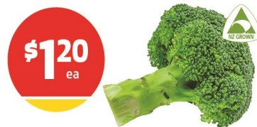
Fresh Cut Broccoli