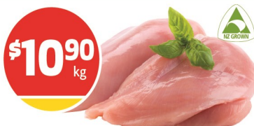
Fresh NZ Skinless Chicken Breast Fillets

Prices apply until 21st June 2020. While stocks last at SuperValue Milton only.