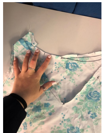
Regan Roxburgh working on her proto type neckline.