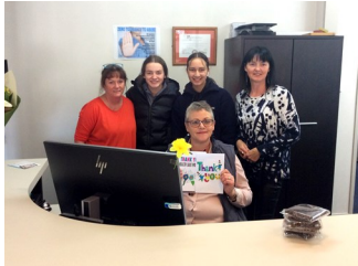
Milton Medical Centre