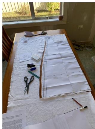
Mia Flannery's pattern ready to cut.