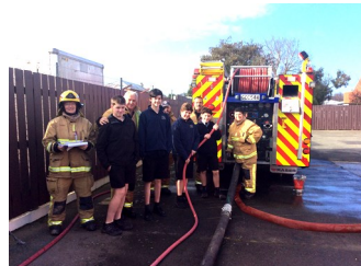
Milton Fire Brigade