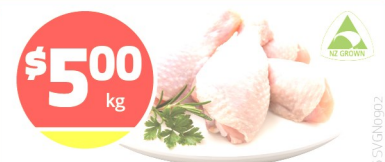
Fresh Chicken Drumsticks (Product of NZ & Excludes Free Range)