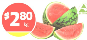
Watermelon (Product of NZ)

Prices valid 7th-13th February 2022, or whilst stocks last.