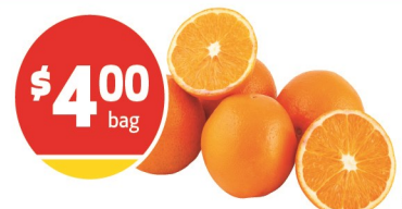
Australian Navel Oranges 1.5kg