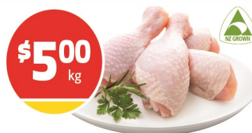
Fresh NZ Chicken Drumsticks

Prices apply until 28th June 2020. While stocks last at SuperValue Milton only.