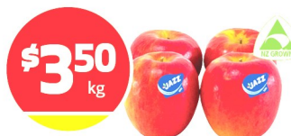
Loose Jazz Apples

Prices valid 16th - 22nd August 2021, or whilst stocks last.