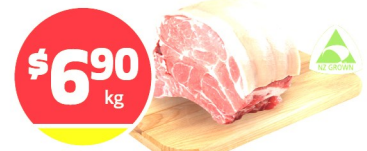
Fresh NZ Pork Shoulder Roast (Excludes FreeRange)