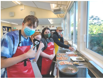
Left: The pizzas get a thumbs up from this team!