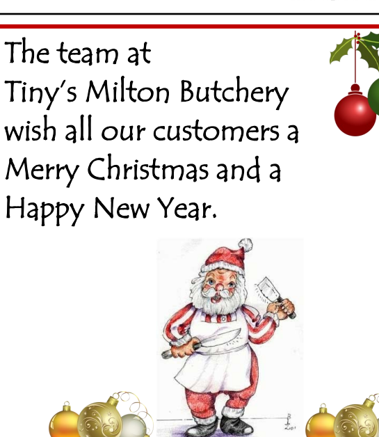
Check our Facebook page for our Christmas Hours.