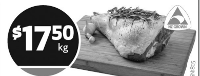
Fresh Lamb Leg Roast (Product of NZ)