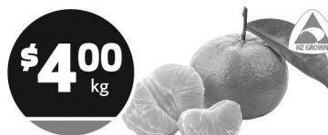
Loose Satsuma Mandarins (Product of NZ)

Prices valid 16th-22nd May 2022, or whilst stocks last.