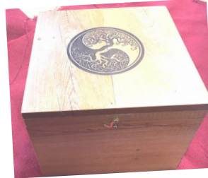
Kamile Year 12

Some amazing work is coming out of the Wood Tech room. Students are showing an increasing level of skill in their work using a range of technology.