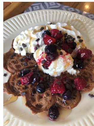
Zoe McElrea's Easter baking