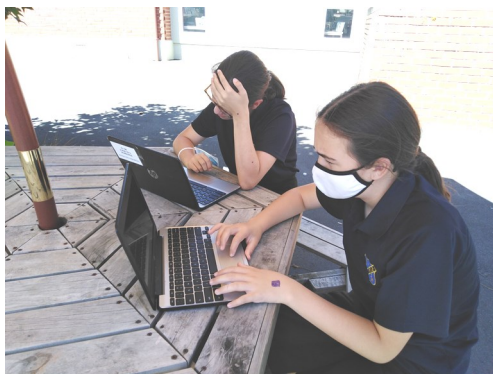
Left: Year 7 and 8 Pr Homeroom students work in the shade in the courtyard.

As part of the Covid Protection framework, teachers are encouraged to get their classes learning outside as much as possible. On Monday, the fine weather made this a lot more bearable, and students were happy to get out in the fresh air to learn!