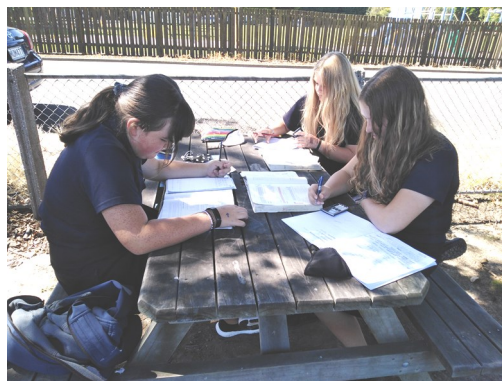
Right: Year 9 and 10 Maths students working in the shade under the trees near B block.