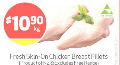
Fresh Skin-On Chicken Breast Fillets (Product of NZ & Excludes Free Range)