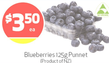
Blueberries 125g Punnet (Product of NZ)

Prices valid 21st - 27th February 2022, or whilst stocks last.