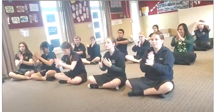
Above and below: Students working on their sāsa - a traditional Samoan dance.