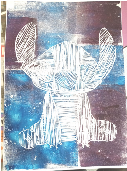
Left: Blue and purple woodcut print by Kaitlin Burgess.