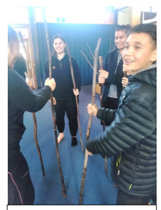
A competitive round of maui-matau.