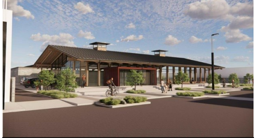
Concept drawing of the new pool.

The Committee is looking forward to meeting people at the Tokomairiro Show to update them on progress and explain the various ways they can be involved and support the project. We will have Donkey Bingo and Paint Ball activities at the Show. Other upcoming opportunities include a stock drive and signing up for Pay as you Go.