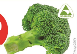
Freshly Cut Broccoli