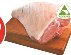
Fresh NZ Pork Leg Roast (Excludes Free Range)