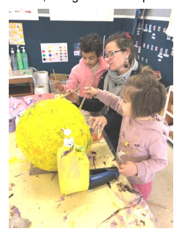
Maui catches the sun - all the ways this pakiwaitara can be extended into children's learnina.

At Milton Kindergarten we are just about to undertake our journey through enviroschools. Through this we are looking at promoting Te Ao Māori. We are focusing on developing working theories, promoting Atua Māori, developing Te Reo Māori (that moves past directional language. We will also be looking at attitudes of playfulness, curiosity and exploration by using the notice, recognise and respond formula to enrich children's play and learning through Te Ao Māori.