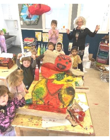
We have been challenging and refining children's working theories, as they make links with what they know about modern day hero's and modern villains' and Átua Māori.