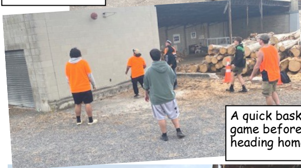
A quick basketball game before heading home.