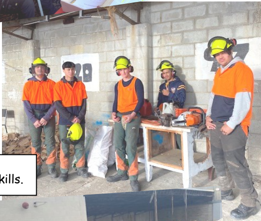
Learning chainsaw skills.