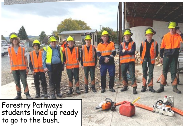
Forestry Pathways students lined up ready to go to the bush.