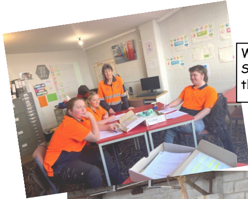
Working on Unit Standards in the classroom