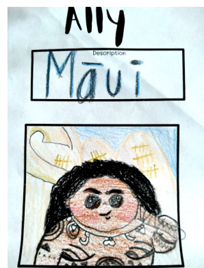
By Izzy Leyden