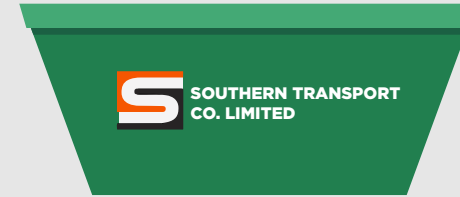
2 4.5 Cubic Meters Length 3.15m Height 0.90m Width 1.7m *Bin sizes Vary