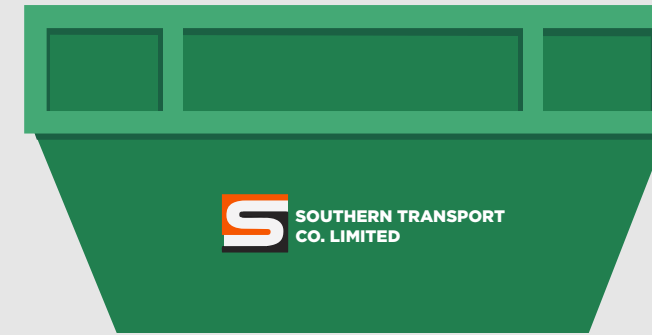
5 7.5 Cubic Meters Length 3.6m Height 1.5m Width 1.7m *Bin sizes Vary