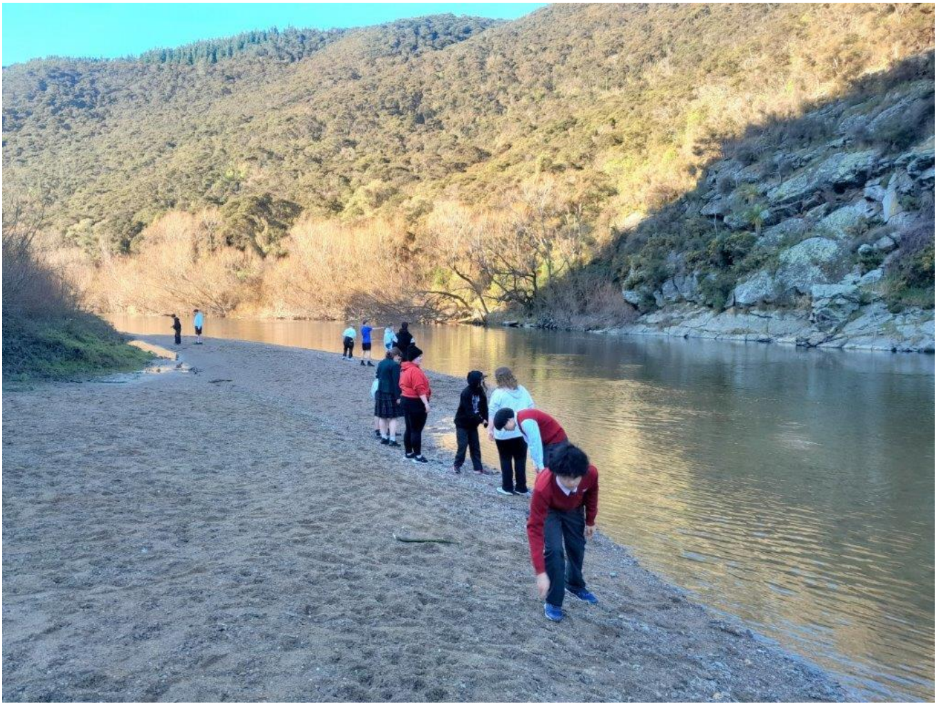
Year 12 Activities: Skimming stones at Outram Glenn.