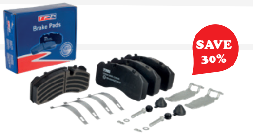
1970349 Disc Brake Pad Kit Suits Knorr SB6/SB6 caliper, MANTGA, Iveco Eurocargo