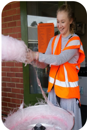
Lots of activities and fun had by all. Thank you for sharing your photos with the GGI Informer.