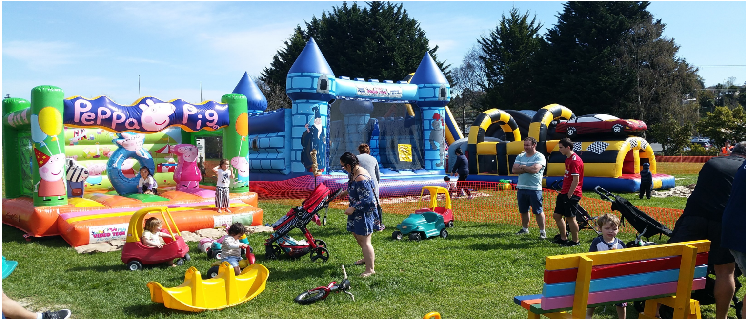
It was out with the sunscreen at the St Peter Chanel Fair recently, as Spring turned on a scorcher for the event.