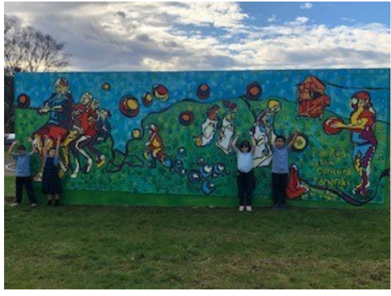
Students from Concord school celebrate their sports and games mural

Email: Informer@greatergreenisland.org.nz