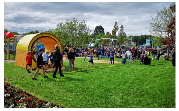
Green Island Playground Opening August 2019