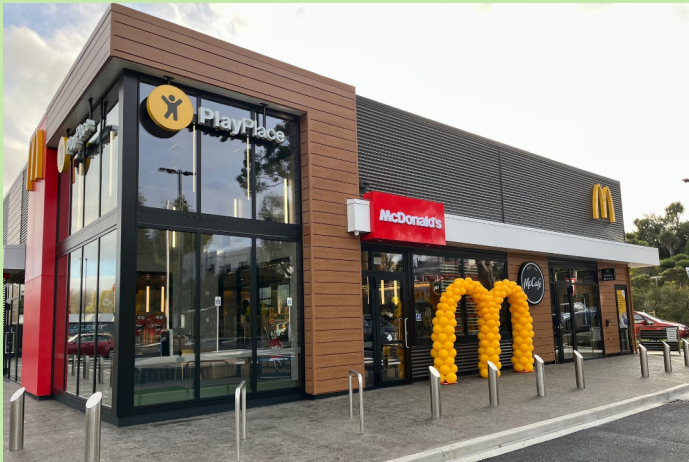
McDonalds Green Island opened mid-May!

It's safe to say McDonald's Green Island is off to a golden start – and the future is looking bright.