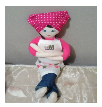
Don't be shy.

Abbotsford Women's Institute meets in Green Island on the 4th Thursday of each month. Our group is a great organisation for ages 18 to 108. Great new friendships, fun and support can be found. We also have a coffee group, choir and winter craft group. You will be given a warm welcome, a cuppa and cake if you wish to come along.