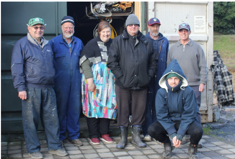
Green Island Shed Members on site

There is currently one female member, but there have been others in the past.