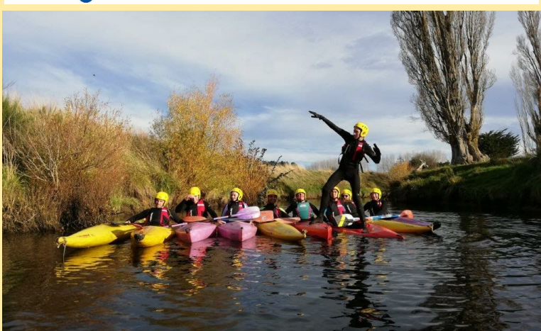
A group of participants in the 2019 Berwick Outdoor Experience