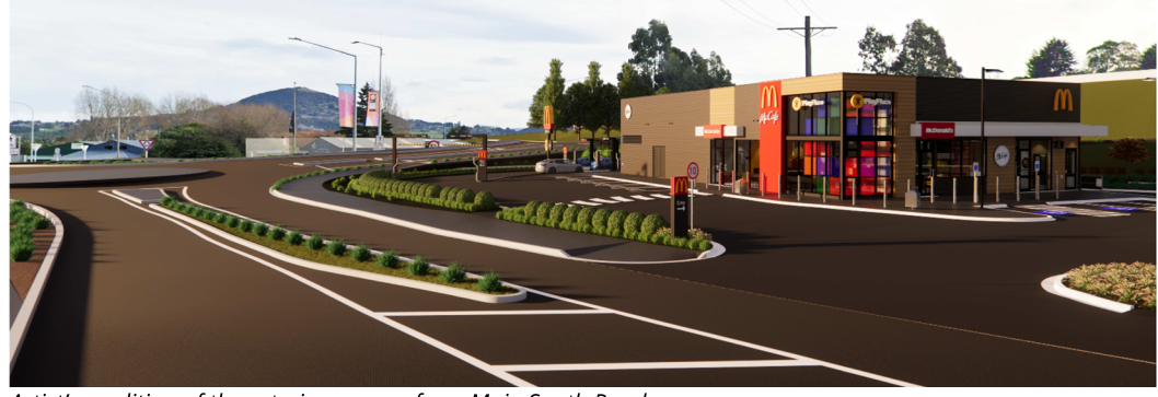
Artist's rendition of the exterior as seen from Main South Road.

With the opening just around the corner, job advertisements will begin appearing within the next month. If you're interested in applying, be sure to keep an eye out for announcements!