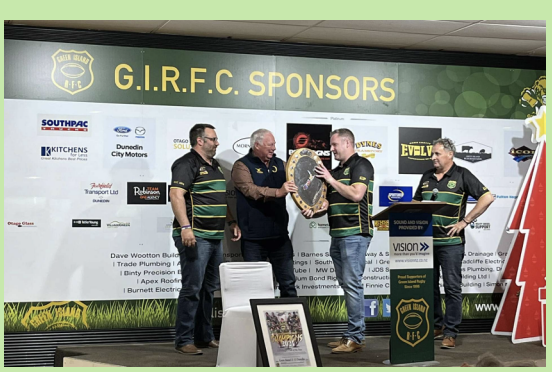
The Green Island Rugby Club named the Bunnings NZ Rugby Club of the Year 2024.

Green Island Rugby Club has named been the 2024 Bunnings New Zealand Rugby Club of Year, an honour that recognizes the dedication and passion of its entire rugby community.