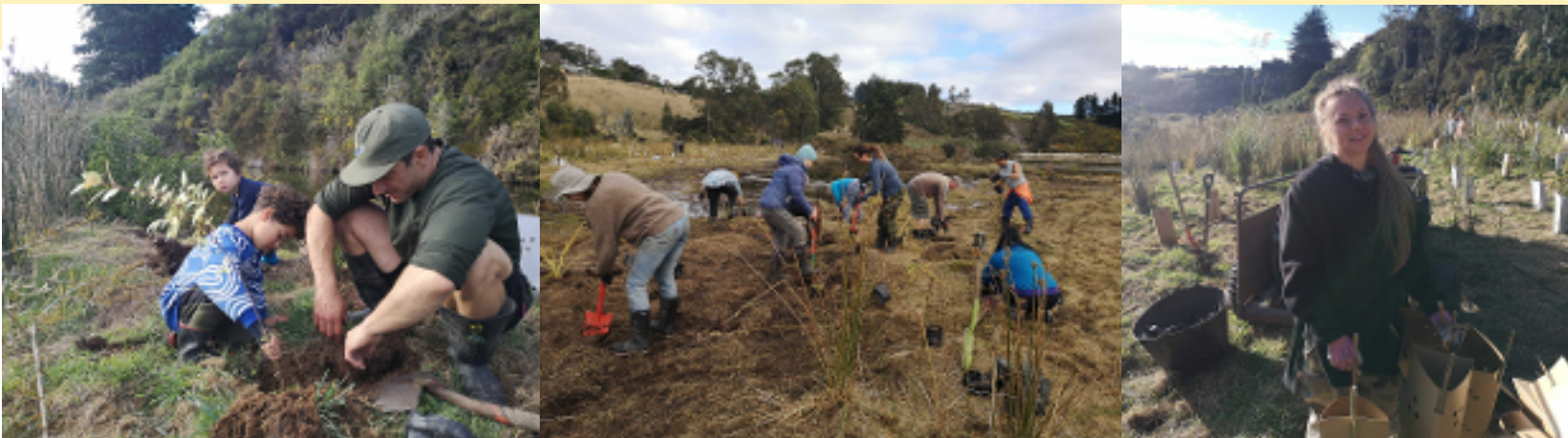
Above: Ōtokia Creek Planting Piece