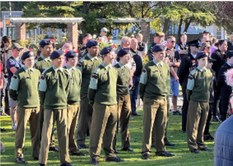
Above: "City of Dunedin Cadet Unit"