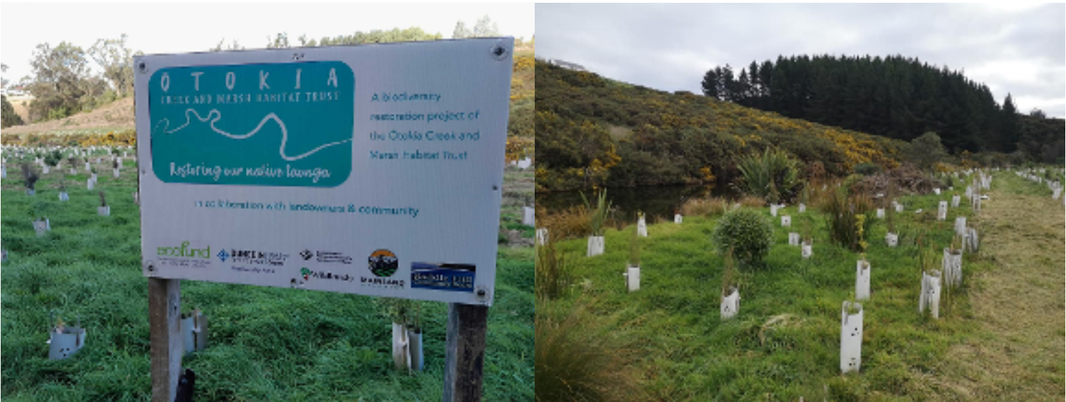
Above: Ōtokia Creek Planting Piece