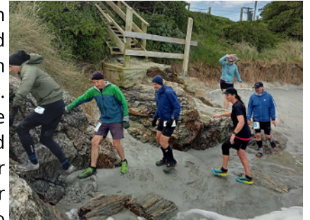
When the going gets tough...

This inaugural Brighton Backyard Ultra marked the beginning of an exciting annual tradition. The event's ability to unite the community and provide a platform for athletes to push their limits is a testament to the power of sports in fostering camaraderie and personal growth.