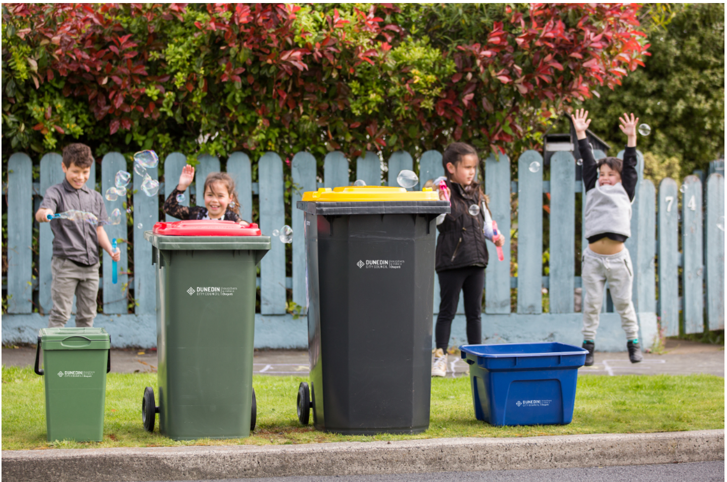
The green lidded bin (far left) is similar to the 23 litre food scraps bin householders in units or apartments with no or little garden will receive. The red-lidded rubbish bin is the same 140 litre size as the rubbish wheelie bin all Dunedin households will receive next year. Eighty percent of Dunedin properties have one or two houses and a garden, so they'll receive a 140 litre green lidded food and garden waste wheelie bin (not pictured).

For updates, download the free DCC Kerbside Collection app or check http://dunedin.govt.nz/kerbside-changes .