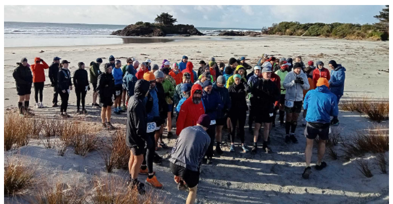
The competitors gather - 74 Runners prepare for the Ultra