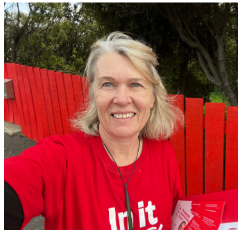
Above: Ingrid Leary campaigning

Welcome to Community Kōrero, a column where The Informer chats with a local identity. In the hot seat this month is recently re-elected MP for Taieri, Ingrid Leary.