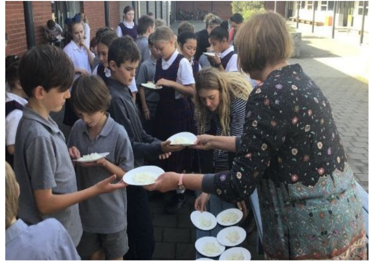
Photos from the school's Rice Day. Students ate rice in solidarity with the poor in South Sudan and in support of Caritas' ministry and work with those on the margins.