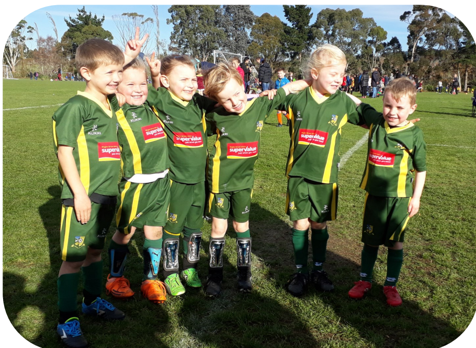
Above: The Green Island Tigers enjoying their first tournament as a team.

On May 20th, the Green Island Junior Football Club had our 42nd annual 7 aside tournament. For teams like 6th GI Tigers, it was their first taste of 7 aside playing 3 games in one day! We had over 100 teams from throughout Dunedin competing in the tournament. Three Green Island teams won this grade this year - GI 10 Vipers, GI 11 Bombers and GI 8 Scorpions. There were plenty of goals scored, stories told and memories made. We thank our many volunteers and sponsors for making 2018 one of the best tournaments yet.