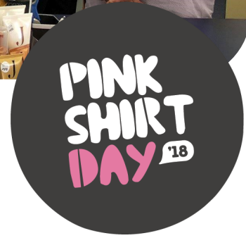
Below: An impressive effort in supporting Pink Shirt Day by students, staff and families at St Peter Chanel School.

Greater Green Island Schools and Businesses dressed up in Pink on May 18th to celebrate the diversity in our communities and to promote positive social relationships. Pink Shirt Day is a national day which aims to create schools, workplaces and communities where all people feel safe, valued and respected. The day is also one that makes people aware that we can work together to stop bullying. Well done to all involved.