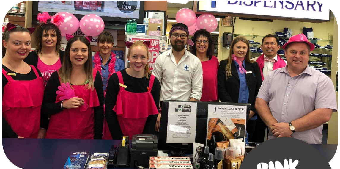
Above: Larson's Pharmacy staff looked great in their Pink outfits.