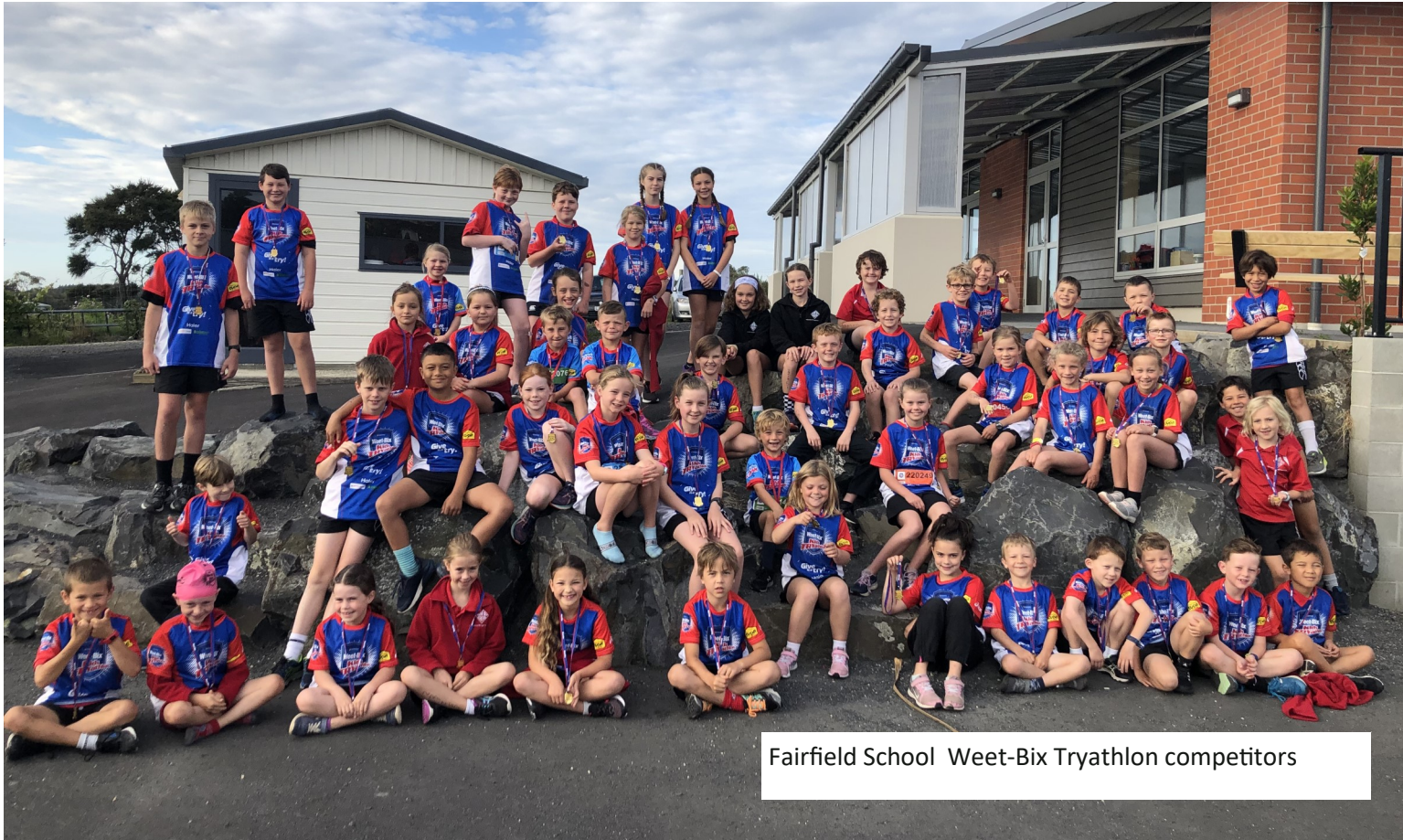
Fairfield School Weet-Bix Tryathlon competitors