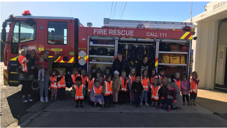
Sitting in a Fire Engine is nearly every kid's dream, and for Little Rock Preschool children, that dream became a reality.