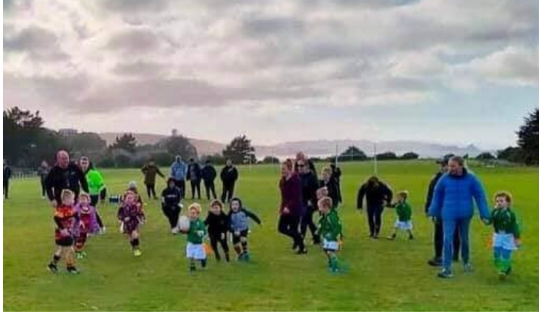
You little ripper!! Winter is here, and that means the Brighton Rugby Club is ripping into action with its youngest players.