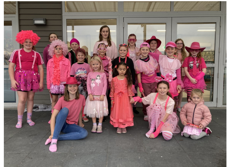
You may have had to adjust your eyes slightly if you visited Fairfield Primary School, last month.

Thanks to the generosity of time by the Brighton Volunteer Fire Brigade, the children were able to visit their local station recently.