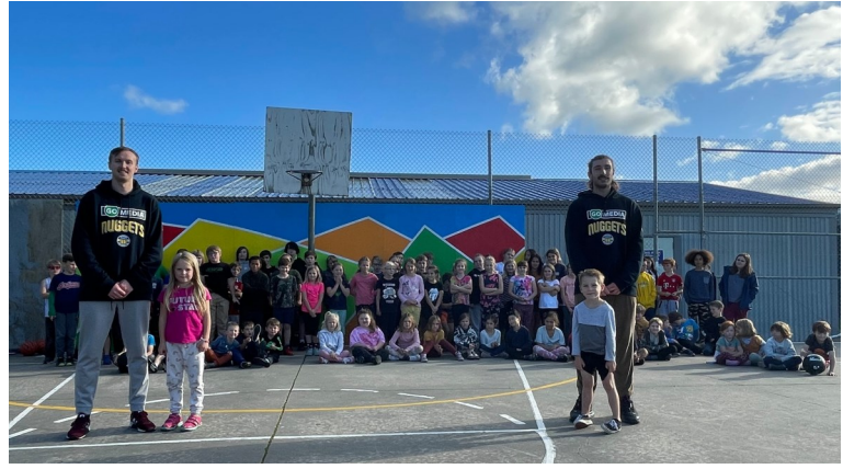
Big Rock Primary School students went home with an extra bounce in their step, last month.