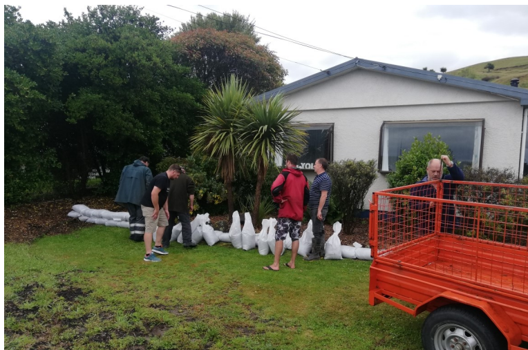
Pictured above, residents gather to place sand bags on an Ocean View property

Contractors were also hired to clear the Otokia Creek estuary, which saved the water surges flooding the camp.