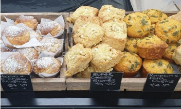
Green Island Cafe 193 Main South Road, 0210 581 077

Green Island Cafe is located at the center of Green Island in the Post Shop Complex. We offer a wide range of delicious food and coffee to eat in or takeaway. All food is made fresh on site.