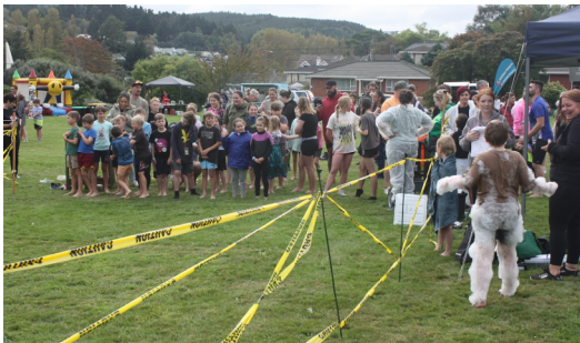
Youth getting ready to run away from zombies