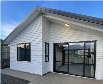
Above & right: Burgess Street Kāinga Ora homes

https://letstalk.kaingaora.govt.nz/dunedin/map