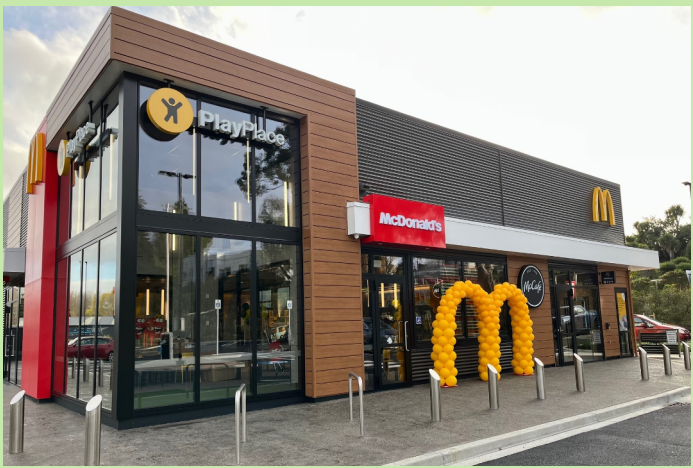
McDonalds Green Island opened mid-May!

It's safe to say McDonald's Green Island is off to a golden start – and the future is looking bright.