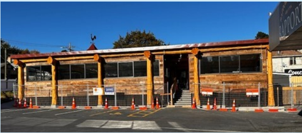
Concord Inn front facade - rebuild almost complete

And it's not just talk. Known for their award-winning pub meals — some of the best in Dunedin — the Concord Inn is staying true to its roots with affordable, hearty dishes that locals rave about. The rebuild is designed with the customer in mind: expanding the restaurant area for a