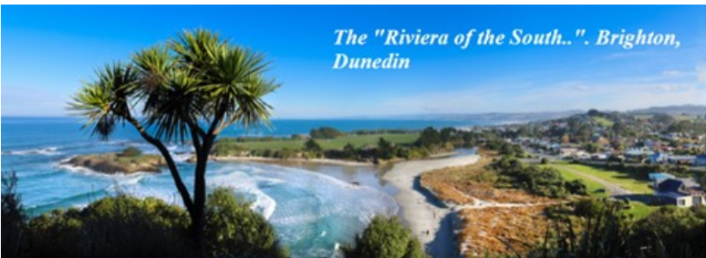
The "Riviera of the South..". Brighton, Dunedin