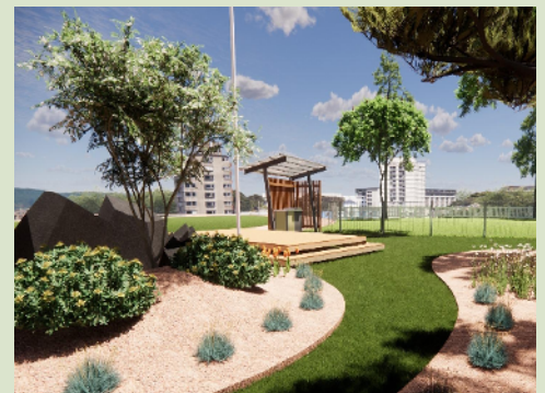
Artist's impression of stage, BBQ, and memorial.