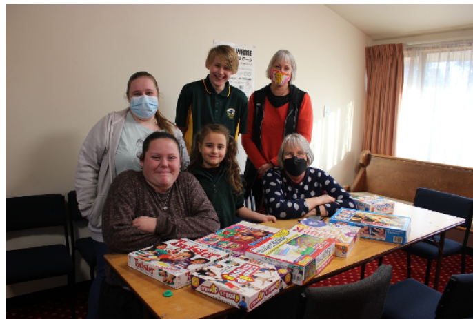
Photo: Old school style gaming with the Oasis after-school program.

The Green Island School bell pierces the air at 3pm, and there's a short period of silence before excited footsteps hurry through the doors of St Mark's Anglican Church.