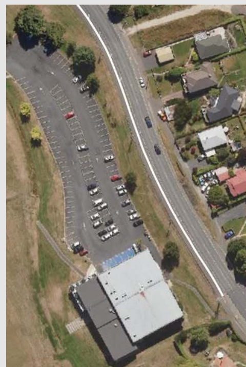
Aerial view of Sunnyvale Community Centre and Main South Rd

Let's work together to make parking at Sunnyvale safer and easier for everyone.