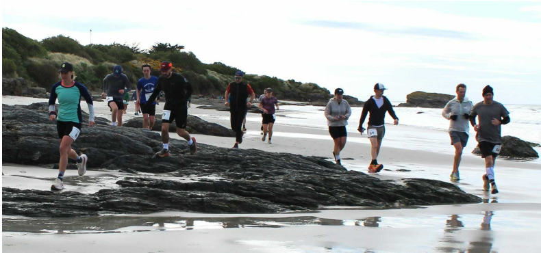
Competitors traversing Brighton Beach in a previous Brighton Backyard Ultra event

The course itself is a showcase of Brighton's breathtaking natural beauty. Runners start on the main beach, before