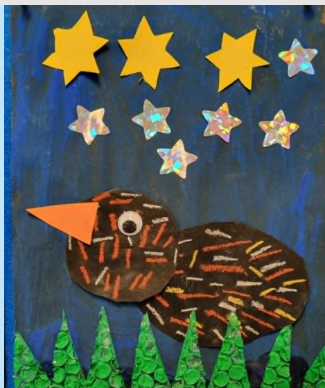
Matariki artwork by B. from Abbotsford School

It's great to see even more variety added to our local shopping village- support local and pop into Frozen Stock Green Island next time you're in the area!