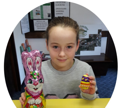
Viana—One of the 2017 winners

The rock will look like an Easter egg. If you find the rock, phone us on 4700814 or message us on Facebook to collect your prize. Keep an eye on our Facebook (Greater Green Island Community) page for updates.