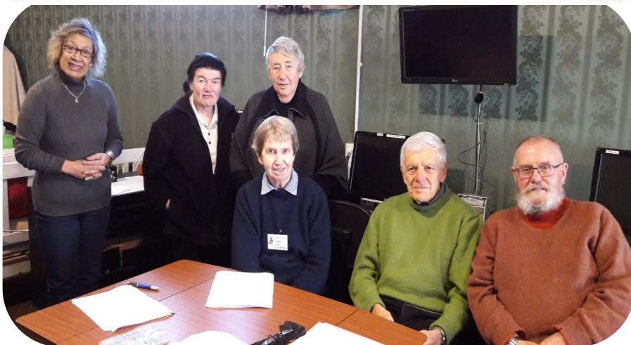
The SeniorNet Committee Members.

The Greater Green Island Community is lucky to have SeniorNet Otago based on the main street of Green Island, at 189 Main South Road. SeniorNet is a community training network that supports and motivates people aged 50+ to enjoy and use technology in their everyday lives. SeniorNet volunteers teach people how to use computers, tablets and smart phones. Classes are run weekdays for two hours per session: 9.30-11.30am and 1.30-3.30pm. In small, friendly and stress-free classes, people gain the skills and confidence they need to get the most out of information technology. People are welcome to bring along their own laptop, tablet or phone. New members are welcome to join by phoning Valerie Steele on 4557380. SeniorNet is also on the lookout for some new volunteers to help teach older people for around 2-4 hours each month. The volunteers choose the subject and device they are most comfortable teaching. Please phone Valerie Steele on 4557380 if you help out and can commit monthly.