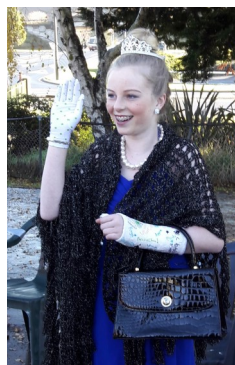
The King and Queen