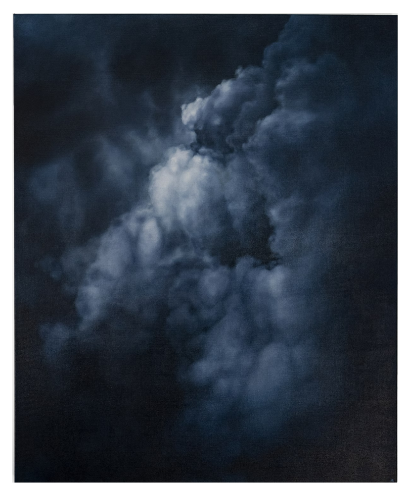
9. Clark Oil on Linen 82 x 105cm $4900