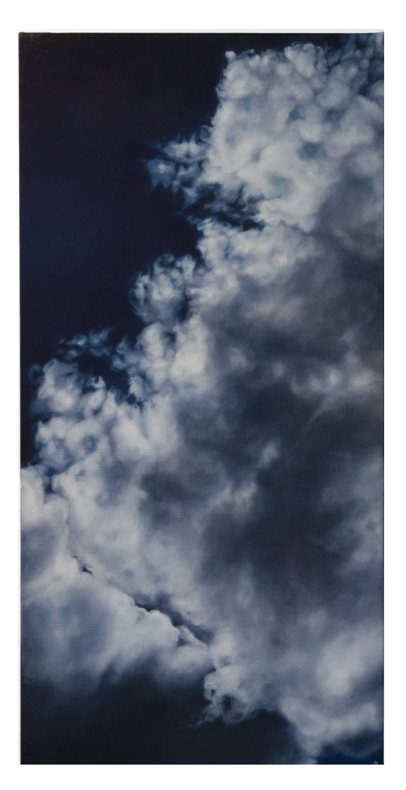
7. Bertie Oil On Linen 102 x 50cm $3100