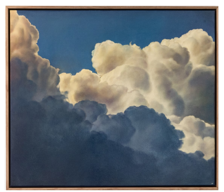
4. BobbyOil On Canvas63 x 73cm (framed)$3100