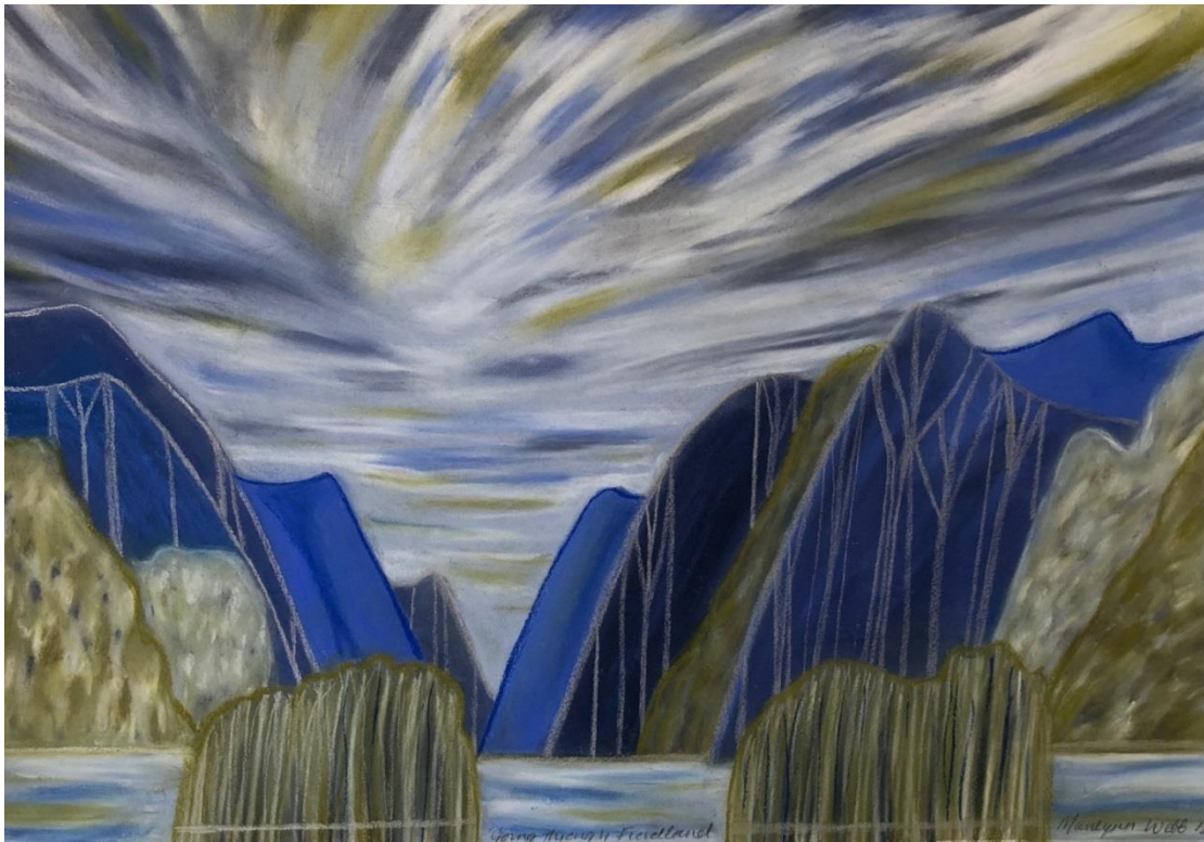
4. Going Through Fiordland (pastel on paper) Paper size: 670 x 470 mm Framed Size: 870 x 680mm $2150