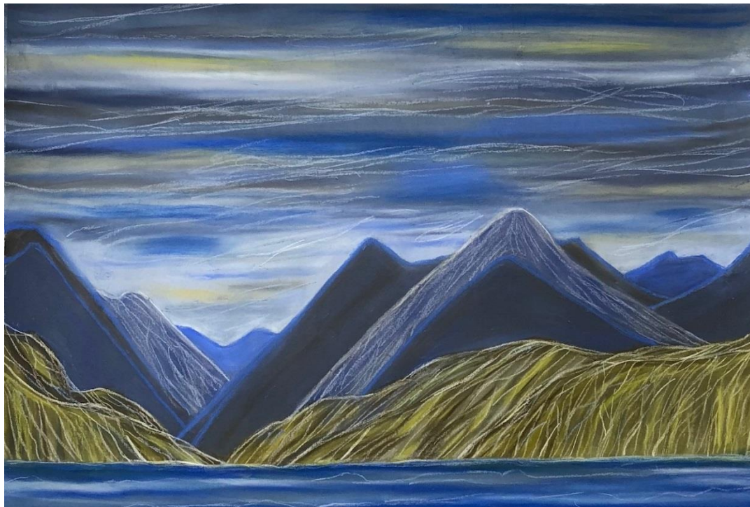
1. Going Through Fiordland (pastel on paper) Paper size: 670 x 470 mm Framed Size: 870 x 680mm $2150