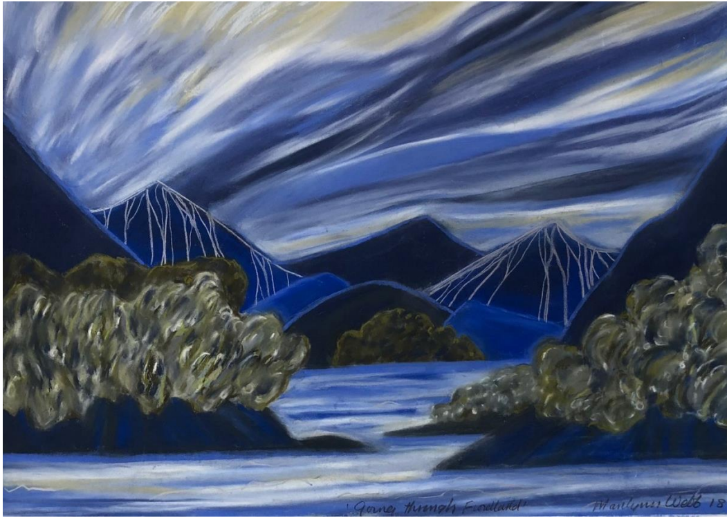
5. Going Through Fiordland (pastel on paper) Paper size: 670 x 470 mm Framed Size: 870 x 680mm $2150