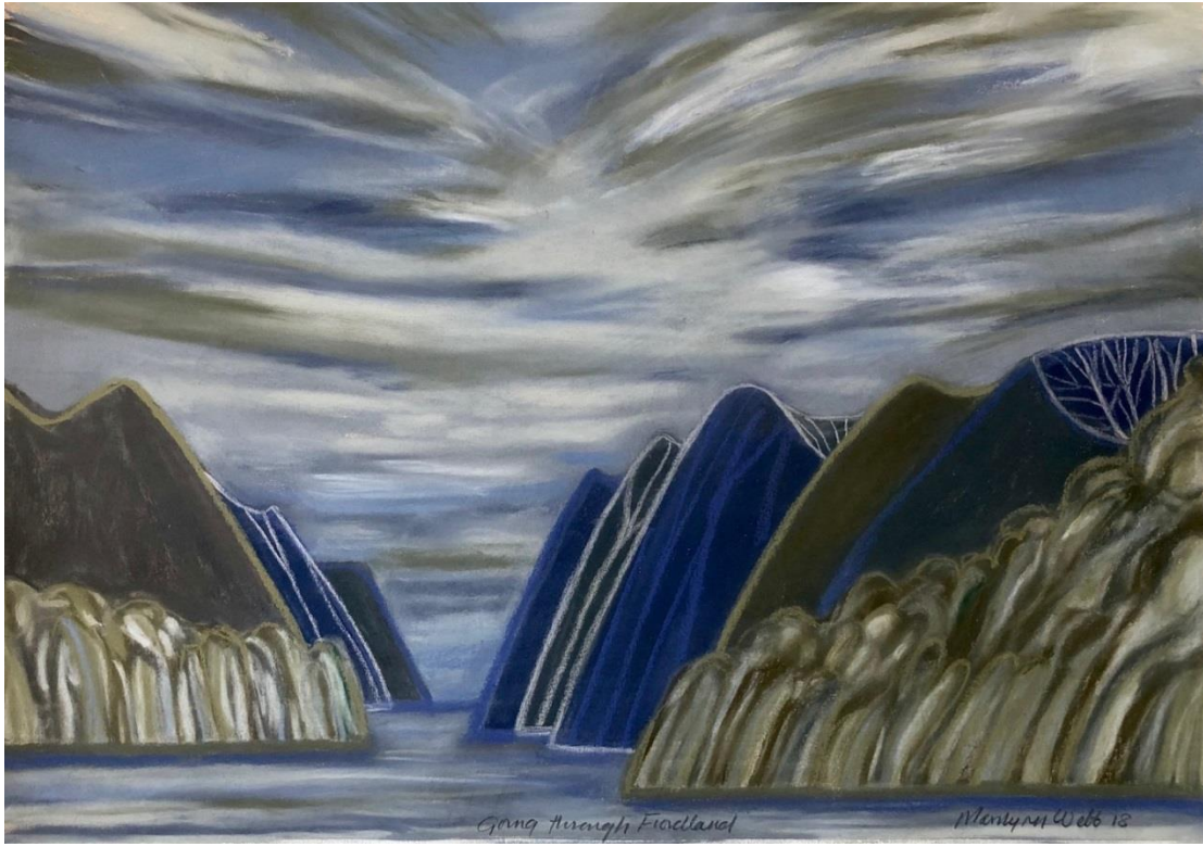
3. Going Through Fiordland (pastel on paper) Paper size: 670 x 470 mm Framed Size: 870 x 680mm $2150