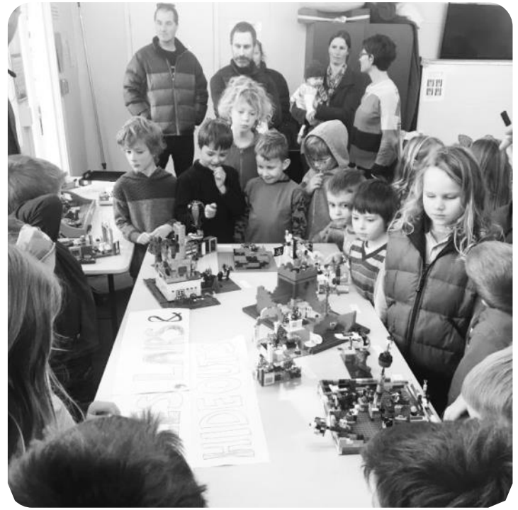
An impromptu Brick Show started as a small idea but attracted 30 young lego enthusiasts to share their creations in the last school holidays.