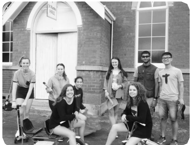
Toroa College students take a break during a painting make-over for the Dunedin Toy Library on Northumberland St.