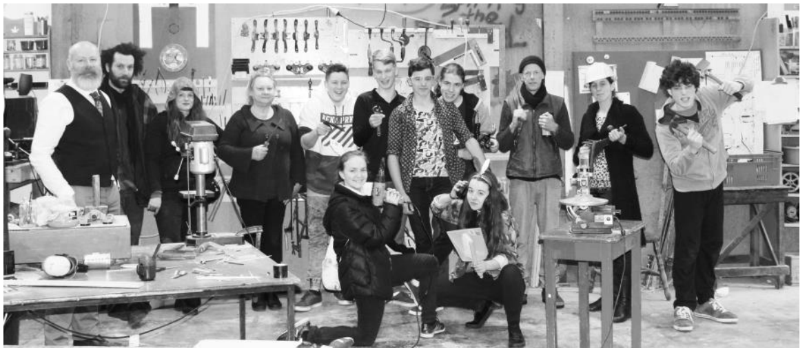
The Tinker School team have been busy thinking, making and solving problems these school holidays.

Alongside our core staff who have experience as professional teachers in local schools, we engage and involve youth from the