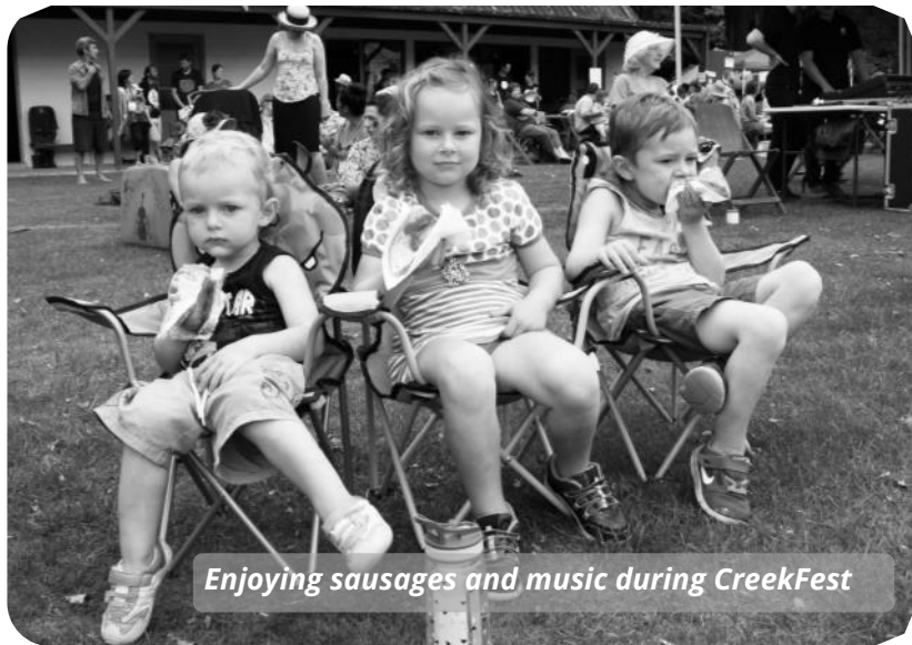
Enjoying sausages and music during CreekFest