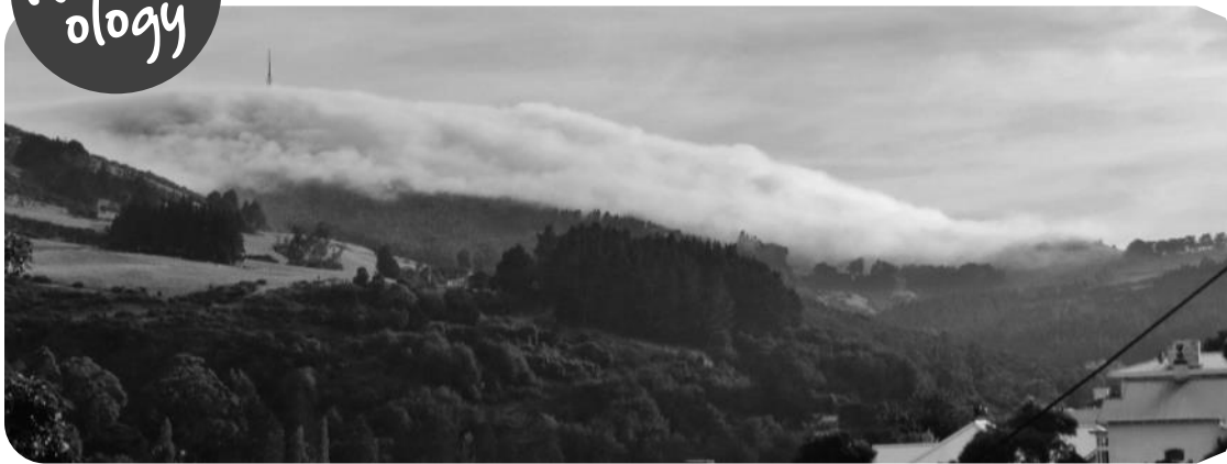
Mt Cargill's toupee rolling in. This is a unique feature of North East Valley's skyline.

WORLD METEOROLOGICAL Day was on 23 March and it got me thinking about the valley's weather, in particular the cloud that drapes itself over Mt Cargill, swirling down the mountain in disappearing fingers of mist.