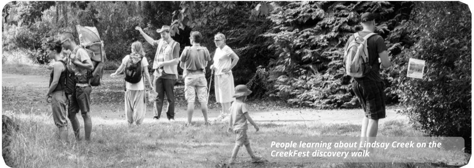
People learning about Lindsay Creek on the CreekFest discovery walk