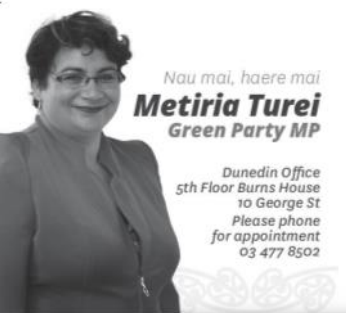
Nau mai, haere mai Metiria Turei Green Party MP