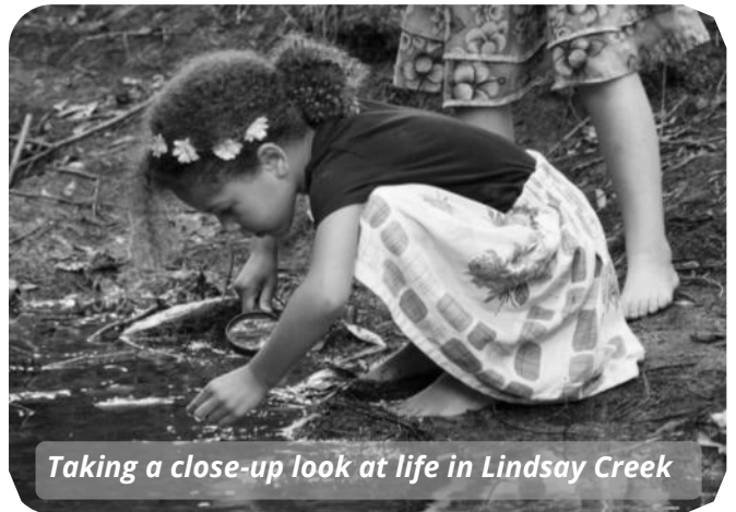
Taking a close-up look at life in Lindsay Creek