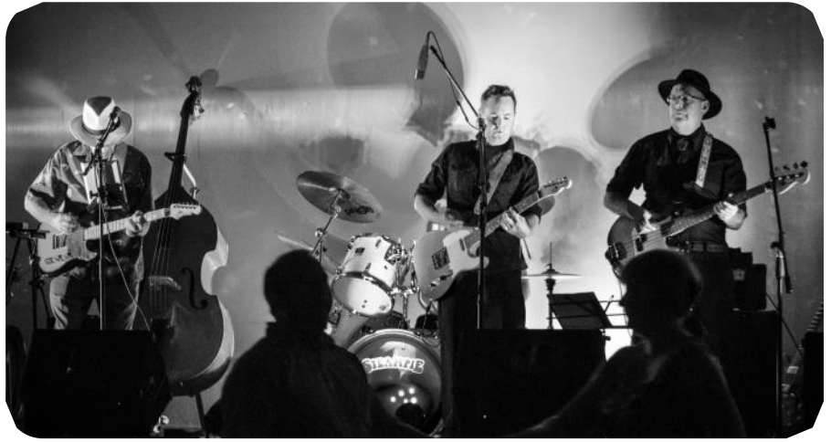
Steampie performing at Nga Maara Hall last month.

LET'S DANCE Dunedin's mission is to revive the good old Saturday night dance down at the local hall. The intention is for folks to have fun dancing to live music with a friendly crowd.