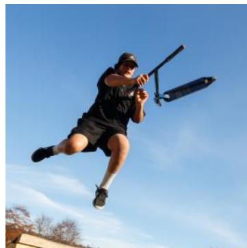
Dunedin North Intermediate pupils work on their skills and tricks at every morning and lunch break.