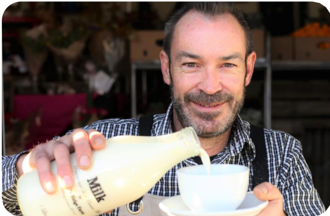
Full cream goodness.. Windy Ridge Farm milk in glass bottles is proving popular with valley residents. Children love it and it makes a lovely creamy coffee.