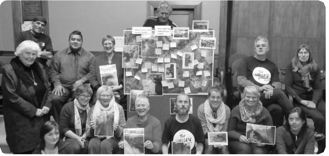
Sharing ideas and generating community discussions at the Valley Project general meeting last month.

ONE OF the Valley Project's goals is to consult with the community and find out what matters to them.