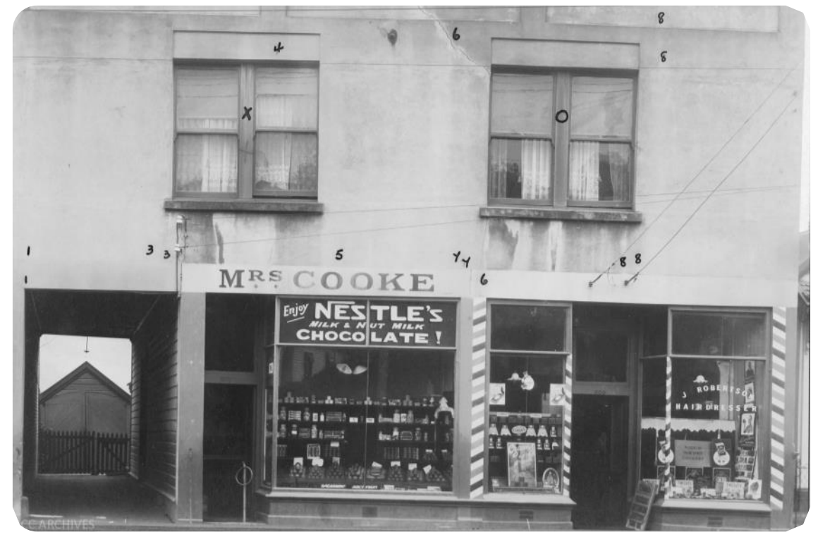
Does anybody remember Mrs Cooke's store? This photo was taken in 1930. The store was at 207–209 Main Road in the valley, where 205 North Road is now. Look at more photos from the council archives on their Flickr page Dunedin City Council Archives.