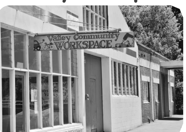
The Valley Community Workspace at 11 Allen St in the valley

We have promoted converting cars to electric, and invited people to join workshops to learn about what's involved. Recent additions to the workspace bring more tools and expertise for craft, making and fixing, and experience and enthusiasm for mentoring youth.