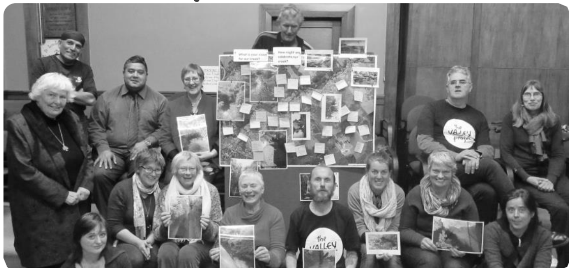
Sharing ideas and generating community discussions at the Valley Project general meeting last month.

Authorised by Metiria Turei Parliament Buildings Wellington