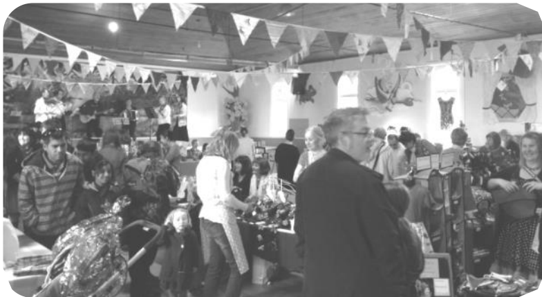
Crowds flocked to last year's Arts Bazaar, which is organised annually by Northern Artery to allow local artists and craftspeople to showcase and sell their work.

The bazaar is known for its vibrant and festive feel with a local flavour. There will be musical performances and Northern Eatery open for business providing shoppers