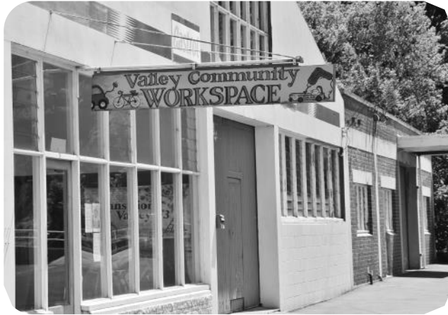
The Valley Community Workspace at 11 Allen St in the valley

We have promoted converting cars to electric, and invited people to join workshops to learn about what's involved. Recent additions to the workspace bring more tools and expertise for craft, making and fixing, and experience and enthusiasm for mentoring youth.